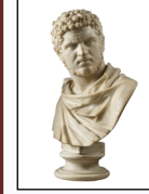
「カラカラ帝胸像 212~217年」 The National Archaeological Museum of Naples

Introducing the bath cultures of ancient Rome and Japan through artworks and archaeological artifacts.